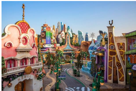
Zootopia brings immersive experience to guests at multiple touchpoints

Zootopia marks the second major expansion of Shanghai Disney Resort since its grand opening in 2016, and the eighth themed land inside Shanghai Disneyland. Spanning years of development, cast members and Imagineers from around the globe, along with artists from Walt Disney Animation Studios, collaborated to build this dynamic city that immerses guests in a holistic experience at every touchpoint. Zootopia will transport guests to a living, breathing mammalian metropolis as soon as they set “paw” on Mane Street. While staying true to the style of Zootopia, the new themed land also features distinct local cultural influences, even including some Shanghai-inspired surprises to tell instantly recognizable stories that resonate with guests and fans in China. A new generation of Audio-Animatronics technology throughout the land, as well as the cutting-edge trackless ride system adopted by Zootopia: Hot Pursuit, enhances the ability to surprise and delight guests of all ages.