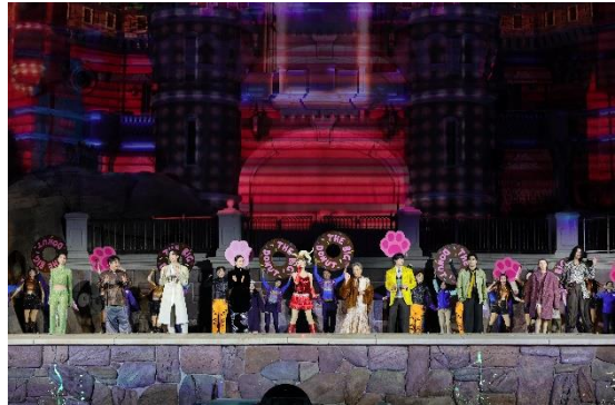
An ensemble of "citizens" of Zootopia, along with Disney performers and invited guests, gather on the stage of the Enchanted Storybook Castle