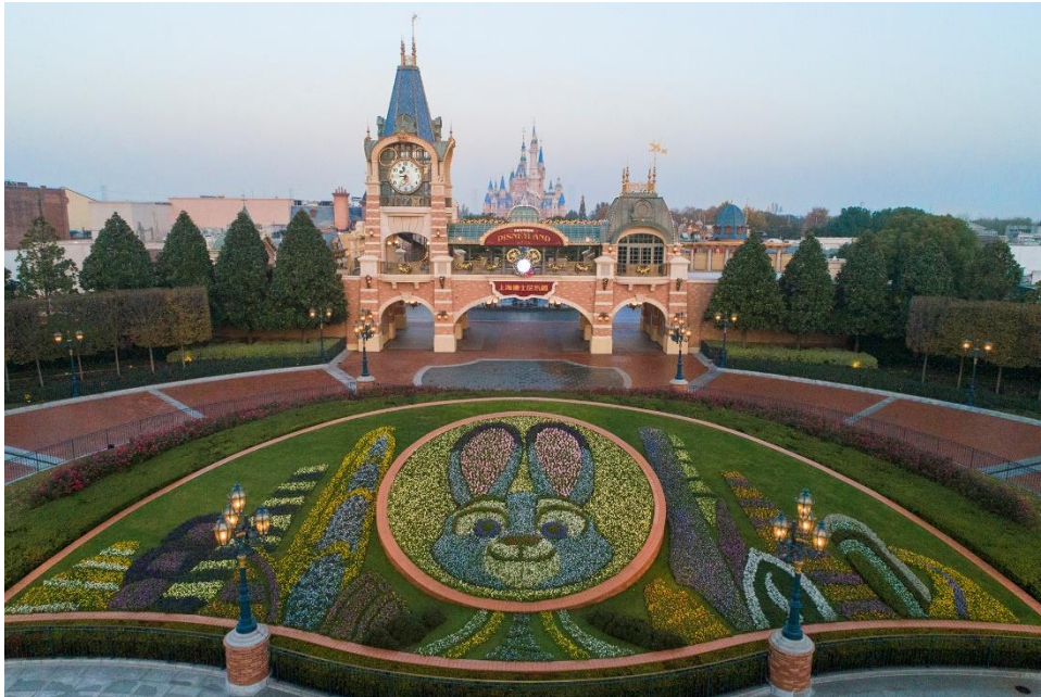
Shanghai Disneyland's iconic Mickey floral is transformed into a Judy floral

new experiences that seamlessly blend Disney's signature storytelling and creativity with groundbreaking, state-of-the-art technology. Featuring an exciting new attraction, innovative entertainment, merchandise as well as food and beverage offerings, guests will find even more reasons to visit Shanghai Disney Resort time and time again.