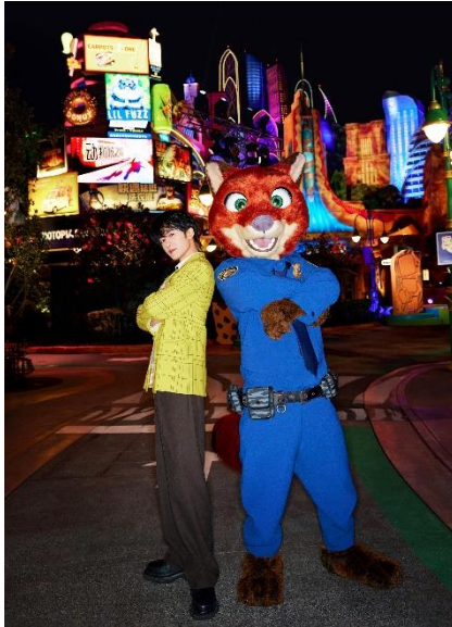
Actor and singer Tan Jianci, and Nick Wilde

In the evening, a star-studded Mane Street Photo Moment saw a distinguished group of community contributors, athletes, artists, writers, designers, singers, and performers arrive at the opening ceremony. In addition to celebrities, highly respected and revered guests from multiple industries were also present. The guests were dressed as various animals that represented their unique and diverse personalities, echoing the theme of the celebration.