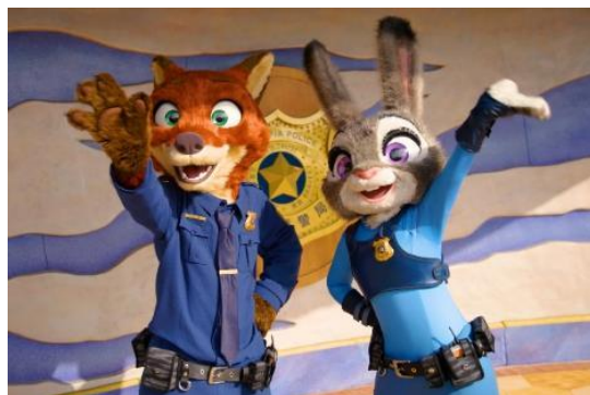
Judy and Nick welcome guests to Zootopia

The Walt Disney Company has a rich 100-year legacy of incredible storytelling, as shown in the highly popular film Zootopia . In China, the film broke box office records to become the country's highest-grossing imported animated feature film of all time, a title that it still holds as of press time. The new land is a wonderful example of the opportunities Disney has to bring new stories to life in immersive ways all around the world. Starting tomorrow, guests visiting Zootopia will be able to enjoy one-of-its-kind