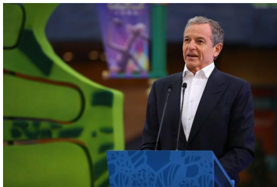
Bob Iger, Chief Executive Officer of The Walt Disney Company, welcomes audience in opening remarks