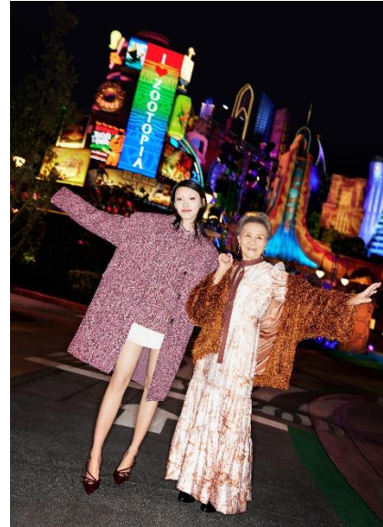
Actress Wu Yanshu and singer Lexie Liu