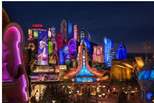
Disney's signature storytelling and creativity creates one-of-a-kind experience