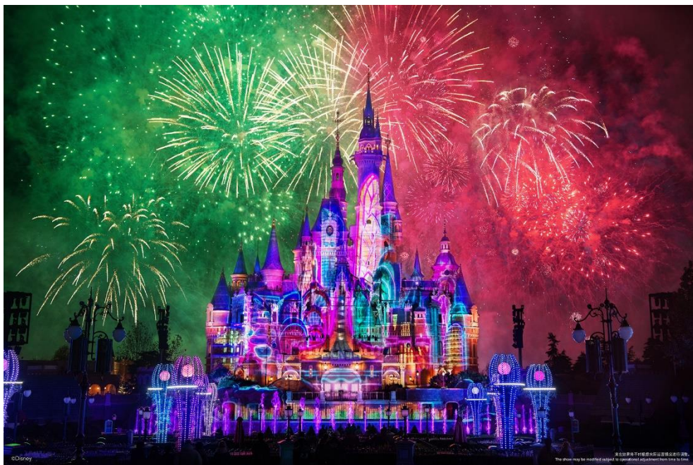
The Enchanted Storybook Castle lights up with special projections and magnificent fireworks