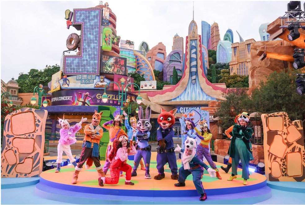
Citizens of Zootopia joined the celebration and invited everyone to “try everything”