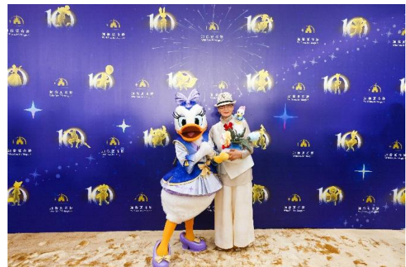
Acclaimed Shanghainese actress Pan Hong, who lent her voice to the Mandarin and Shanghainese narration in the opening scenes of "Once Upon a Time" Adventure inside Enchanted Storybook Castle, with Daisy Duck