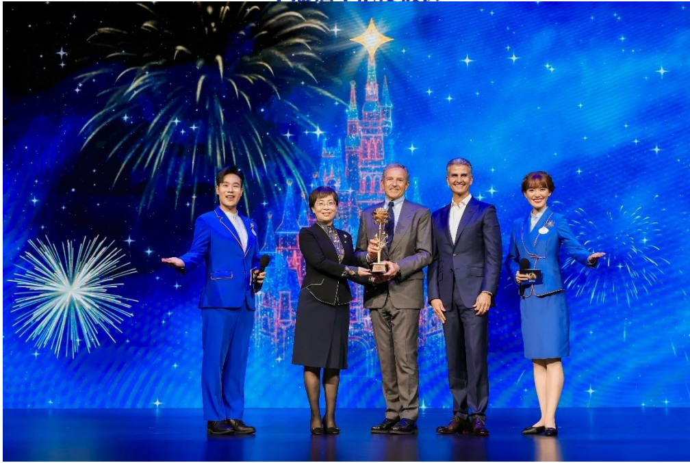
A scale replica of the highest finial on Shanghai Disneyland's Enchanted Story Book Castle was presented to Bob Iger, former Chairman and Chief Executive Officer of The Walt Disney Company, in appreciation of his commitment to creating a resort that is Authentically Disney and Distinctly Chinese

Over the years, Shanghai Disney Resort has enchanted millions of guests of all ages from China and around the world with Disney storytelling and immersive experiences and offerings. Driven by strong guest demand for happiness and unique experiences found nowhere else, Shanghai Disneyland has become a popular theme park worldwide. In October 2025, it welcomed its 100 millionth guest, a significant attendance milestone achieved in just over nine years of operations.