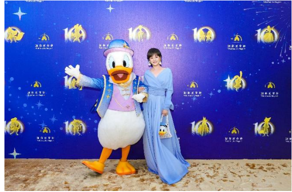
Shanghai Disney Resort Grand Opening Ambassador and actress Sun Li with Donald Duck