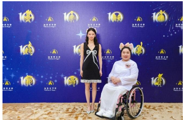
World diving champion Chen Yuxi and famous discus champion Wang Ting