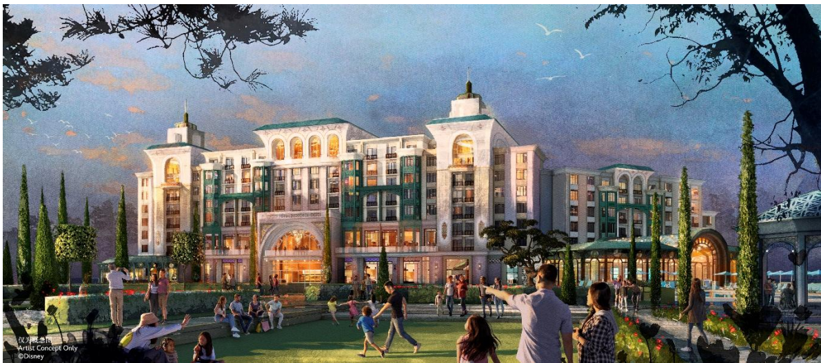
Shanghai Disney Enchanted Star Hotel Artist Concept

Upon completion, the 400-room deluxe destination will offer guests extraordinary views of Shanghai Disneyland and Wishing Star Park, welcoming all into a world where artistry and Disney storytelling are seamlessly blended in all aspects. This winter, guests will be able to enjoy an immersive stay at Shanghai Disney Enchanted Star Hotel, discovering a magical world celebrating dreams, wishes, and a constellation of Disney stories and characters as soon as they step into the hotel. With all-new themed indoor and outdoor pool areas, and a host of other recreational offerings, guests can enjoy a fun, relaxing stay all year round.