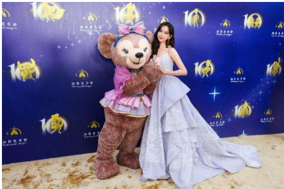
Shanghai Disney Resort VolunTEARS Celebrity Ambassador Lin Chiling and ShellieMay