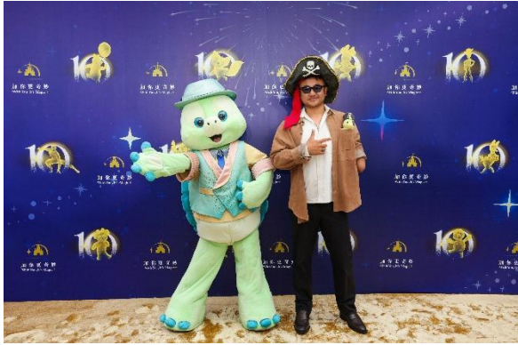
China's top sailing athlete Xu Jingkun and 'Olu Mel