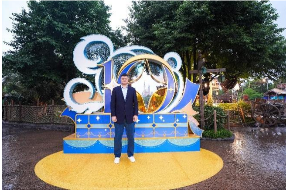
Shanghai Disney Resort Grand Opening Ambassador and international basketball star Yao Ming